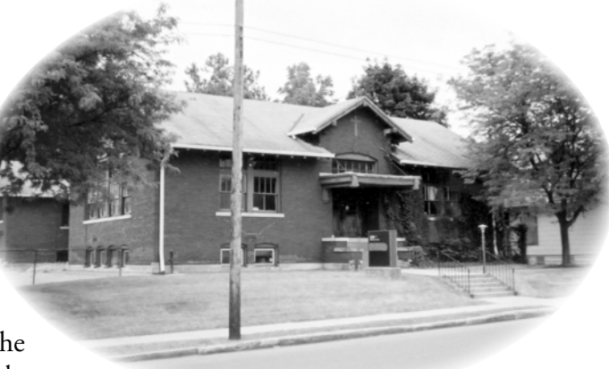
This 1914 school building at St. Cyprian's was a twin of the 1912 church and school. After 1958 these buildings housed the offices of the Diocesan Councils of Catholic Men, Women, and Youth, the Society for the Propagation of the Faith, the Confraternity of Christian Doctrine, and the Sisters of the Poor of St. Francis who ran St. Anthony Hospital.

"In the early 1900's there were not many Black Catholics in Columbus. Most of the Catholics were of German or Irish descent. The Germans lived in South Columbus, the Irish in what was the North, by the railroads; 18th St., 20th St., and Miami, etc. The Irish were settled in St. Dominic's Parish.